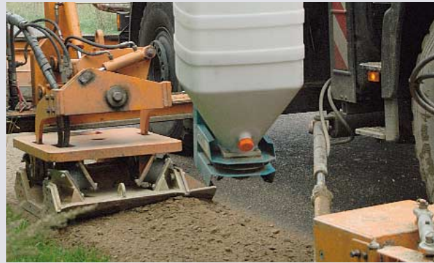
Putting in a road shoulder is as easy as 1-2-3: Build it ...

► Achim Rosinky had the clever idea of streamlining roadside work with a multitasking Unimog. He teamed up with Alfred Söder, a Unimog-compatible system partner based in Bavaria, Germany.