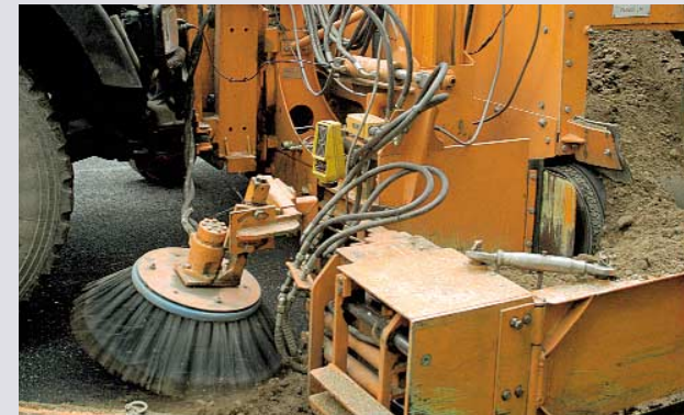
... clean it up.

Attached to the right-hand side is a shoulder layer, an Ammann compactor plate and, if a grass surface is desired, a seeder. The rear of the Unimog U 500 has a sweeper that immediately cleans up the dirt and debris from the site.