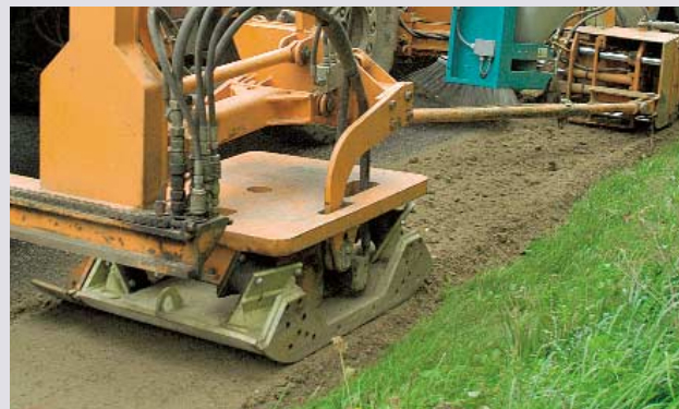
... compact it ...

► The two companies developed a fully integrated system that far exceeded the capabilities of existing machines. They equipped a Unimog U 500 with six different implements. This single vehicle enables Rosinsky to lay up to 1,500 tons of material (such as asphalt, gravel, mineral aggregate or top soil) at any road level in one step.